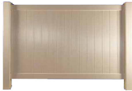
6' T&G Tan

way. There is no fencing permitted in a rear drainage easement. Drainage easements on the side of a home may be approved on a case-by-case basis.