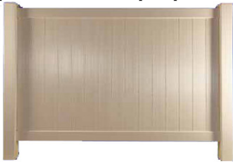
4' T&G Tan Style

Trash and recycling bins are encouraged to be kept in the garage. If an owner wishes to keep trash and recycling bins outside they may not be visible from the street or an adjoining lot and must be kept in an enclosure set back a minimum of 4' from the front corner of the home adjacent to the garage and extending no more than 3' into the side yard and made of 4' high T&G tan fence. Trash and Recycling bins may only put out on the street from the evening prior to the scheduled pickup date through the evening of the actual pickup date.